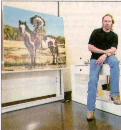
Brett Beadle, Calgary Herald