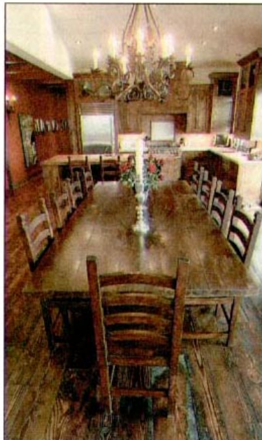
The table that sits 14, the chairs, the chandelier and sideboard all came from the couple's shopping spree in Mexico. The floor is century-old barnboard from B.C.

Beyond his office is another bedroom and