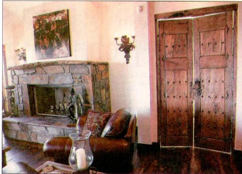
Brett Beadle, Calgary Herald The fireplace in the great room is faced with ironstone. The mantel is petrified wood.