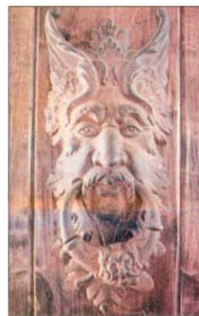
An ornate door knocker on the front door of the house.

Sixty piles were driven 18 to 24 feet into the hillside in order to provide a