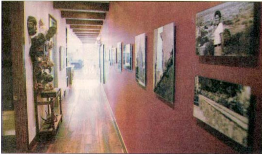
Brett Beadle, Calgary Herald