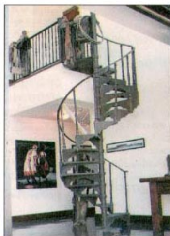
Above, an ornate cross is part of the decorative touches. Right, saddles and a lariat on spiral stairs.